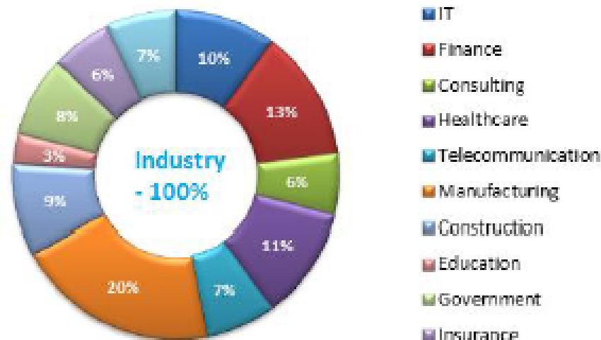
Distribution of companies using Six Sigma by industry

The figure below shows that Six Sigma is not only adopted by manufacturing companies. Six Sigma is increasingly being applied outside of the traditional manufacturing industry because of its inherent benefits. Today's competitive environment leaves no room for error. We must delight our customers every time and relentlessly look for new ways to exceed their expectations. Six Sigma plays a huge role in doing so irrespective of industry.